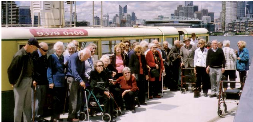
Friends of Strathdon with residents and carers boarding the Tram Ferry to Williamstown.

Many great times were had with a wonderful cooperative team. We thank Friends of Strathdon for their time and many years of support.