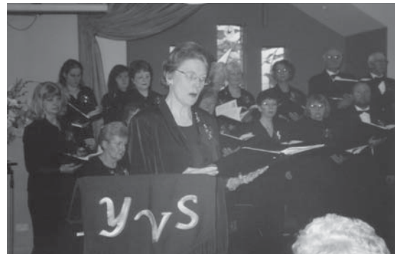
Above: The Yarra Valley Singers perform at Strathdon.

The Community Centre was alive with the sound of harmonious voices singing well known Christmas carols. It was a time to simply enjoy the familiar music and also to participate. A very enjoyable afternoon's entertainment which attracted local community and residents.