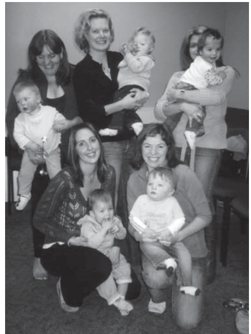
Above: Mothers with their babies from the Play Pals Playgroup. Left: Babies at play.